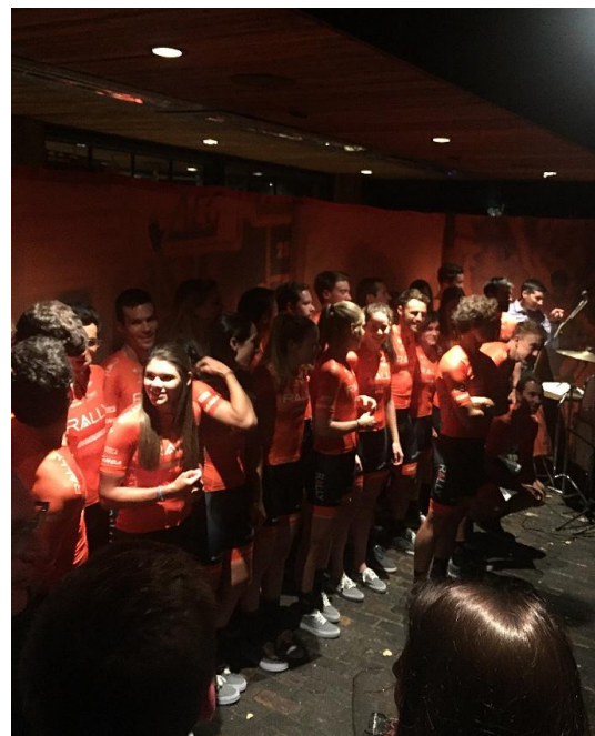
In January, I also had the opportunity to attend the Rally Pro Cycling team launch and media/VIP events. It comes on the heels of the team's training camp in Oxnard, CA. This is the